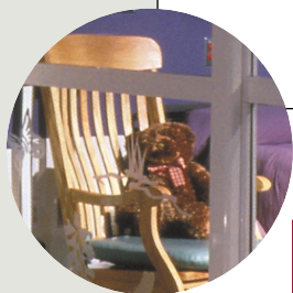
Photographs provided by HDR Architecture. All rights reserved. Photograph by Jeffrey Jacobs

P eriodically, health-care facilities are inspected for compliance with requirements for licensure and eligibility for insurance and government funding. The Joint Commission for Accreditation of Healthcare Organizations (JCAHO) is considered the primary accreditation organization for health-care facilities. JCAHO actively pursues compliance for issues ranging from credentialing of medical staff, patient-care procedural practice, medical records, and other factors, including those associated with safety in the environment of care. Infection-control practice as a part of building systems has become an important issue in health care. The role of infection in patient care can be devastating. There are 2.5 million patients afflicted by nosocomial (hospital acquired) infections each year and 90,000 fatalities 1 . Most of these infections are from issues related to hand washing, but an increasing number are due to failures in the conditions in the environment of care. This is especially