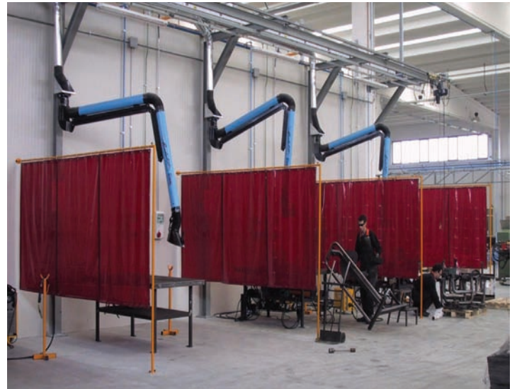
- Evolution Arm industrial application

The industry's premium solution for the extraction of welding smoke, gas vapors, aerosols, oil fumes, dust & more.