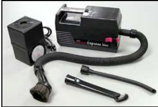
EXPRESS CARTRIDGE VACUUM

POWERFUL. Atrix has built in a new, powerful motor making the Express Plus as powerful as most of the larger service vacuums.