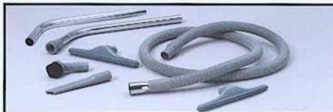
WET/DRY TOOL KIT (Non-Metallic)

Includes: 1-1/2" x 10' Hose, 54" Wand, 14" Floor Tool, 3" Round Dust Brush, and 11" Crevice Tool