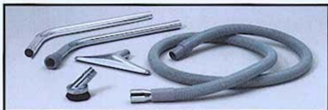
DRY TOOL KIT (Metal)

Includes: 1-1/2" x 10' Hose, 54" Wand, 14" Floor Tool, and 3" Round Dust Brush