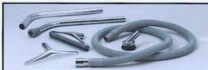
WET/DRY TOOL KIT (Metal)

Includes: 1-1/2" x 10' Hose, 54" Wand, 14" Floor Tool, and 3" Round Dust Brush