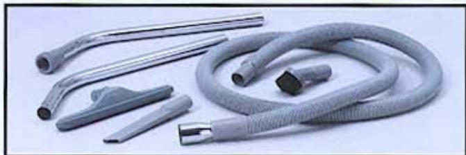
DRY TOOL KIT (Non-Metallic)

Includes: 1-1/2" x 10' Hose, 54" Wand, 14" Floor Tool, 14" Squeegee Tool, and 3" Round Dust Brush